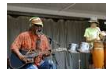
319 Music Fest