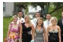
Your Prom Photos 2012