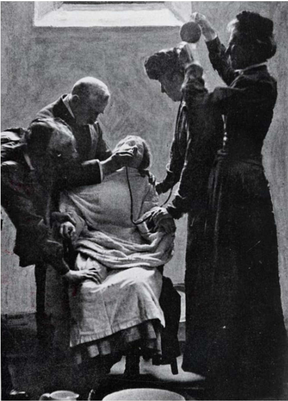
Torture: A suffragette is force-fed in prison

Sylvia Pankhurst was born in 1882, the second daughter of Dr Richard Pankhurst and his wife, Emmeline, who was 23 years his junior. Richard was a brilliant barrister and a founder member of the socialist Fabian Society, together with the playwright George Bernard Shaw and the novelist, H.G. Wells.